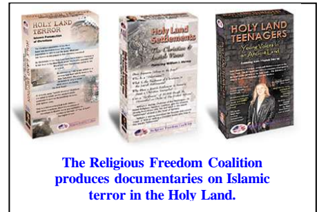
The Religious Freedom Coalition produces documentaries on Islamic terror in the Holy Land.

Currently the Religious Freedom Coalition supports evangelical Christian schools in the West Bank. Unlike the Palestinian Authority run schools which teach hatred of Israel, the RFC supported schools teach biblical kindness and tolerance. The Religious Freedom Coalition also supports Christian evangelists who distribute Bibles and other Christian materials to Palestinians in the villages surrounding Ariel.