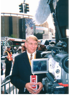
TV interview at the corner of 8th Ave. and 34th. Madison Square Garden is in background.